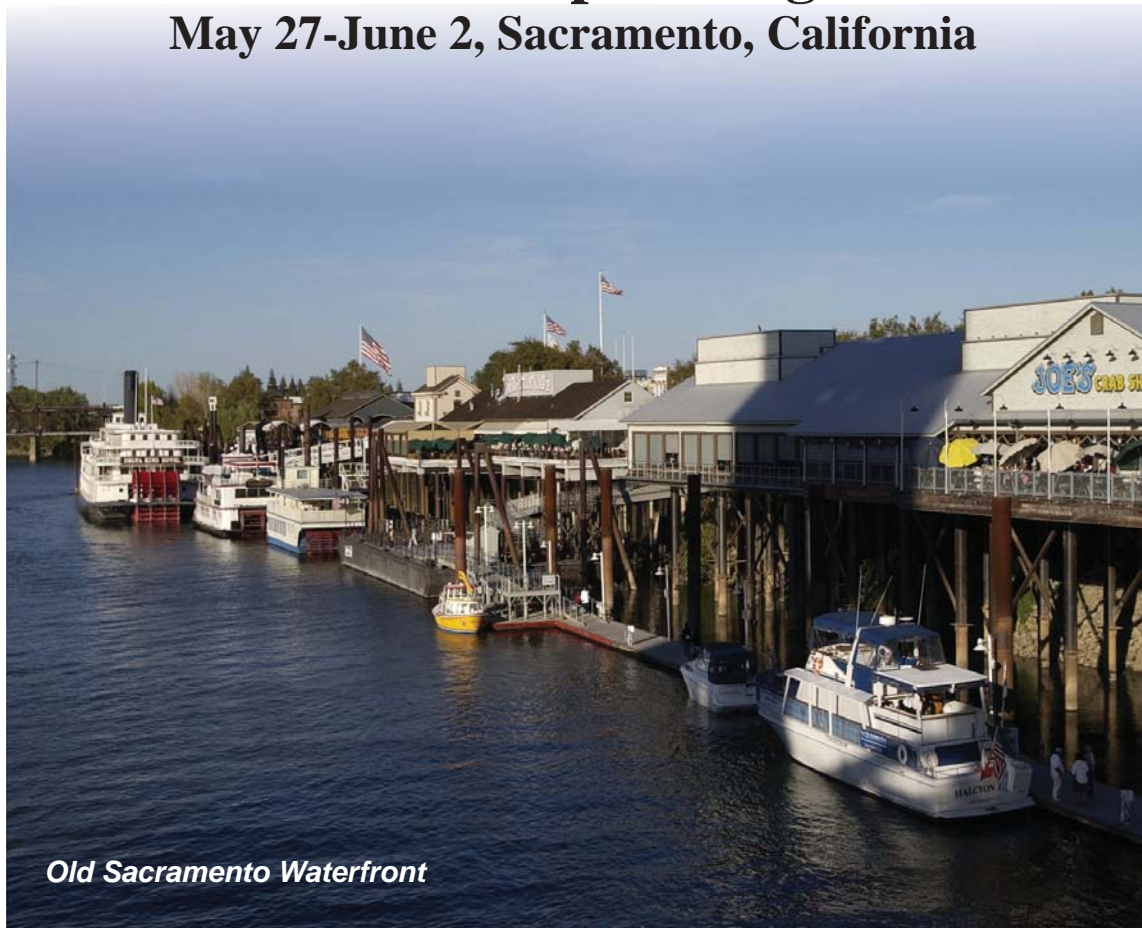
Old Sacramento Waterfront